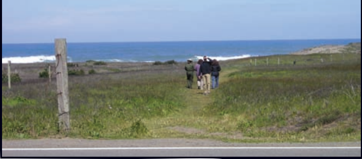
The proposed parking area and trail that would provide access to a popular beach at Virgin Creek just north of the City of Fort Bragg.